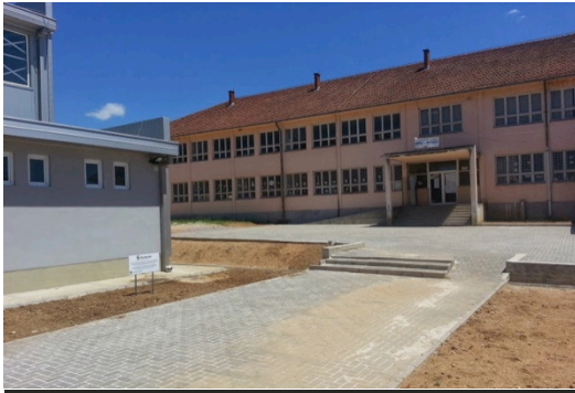
A new schoolyard is currently being built in Ilovitza, a project that Euromax is supporting