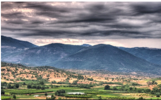
Looking toward Ilovitza hill from the west