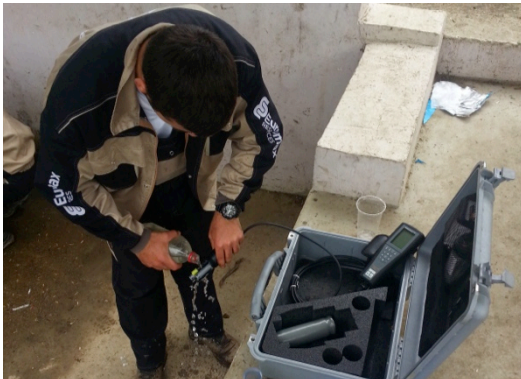
Testing water samples from one of the water wells in Ilovitza village